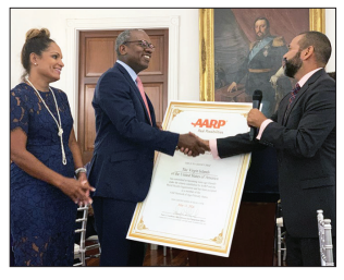
U.S. Virgin Islands