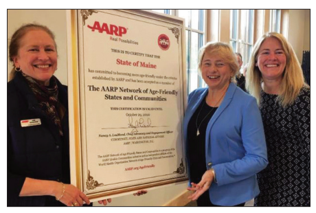
State of Maine