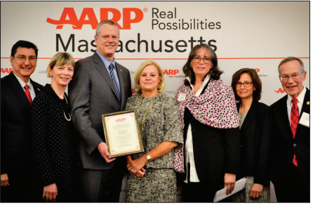
Commonwealth of Massachusetts

See the complete list of enrolled communities: AARP.org/AgeFriendly-Member-List